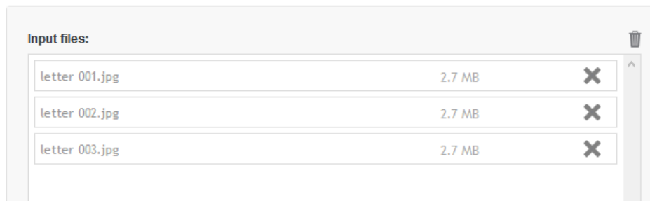
Figure 2: Input files handling

Dragged input files can be reordered by drag and drop. Input files can be removed from conversion process one by one, by clicking the related X button, or all of those by clicking the trash icon over the input files list.